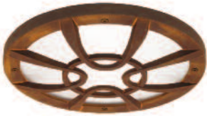
VG - Vandal Guard (RU - iron oxide finish shown)